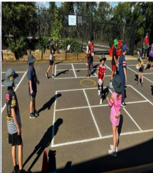
Footy Jersey day – SRC fundraiser