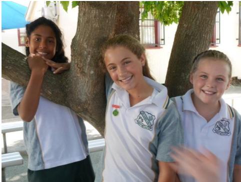
Sports Uniform- Boys and girls (shorts in Summer)

Sports shorts or track pants (cooler weather) and the green and white school sport shirt containing school logo, white socks, joggers and a wide-brimmed school hat.